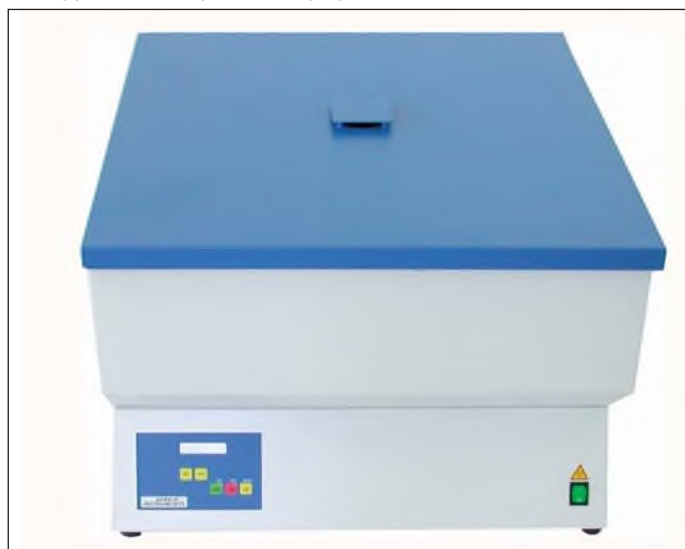
DA450-40, DA450-50 is similar

Sampling Dippers – see BS216-35/BS216-40 in the Bottles section.