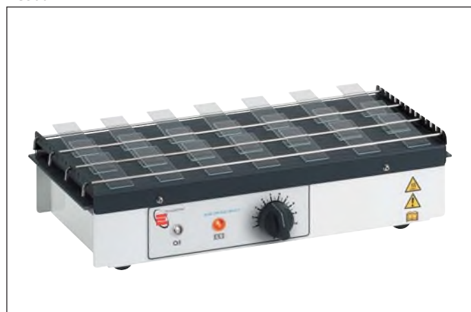
HG310 in use