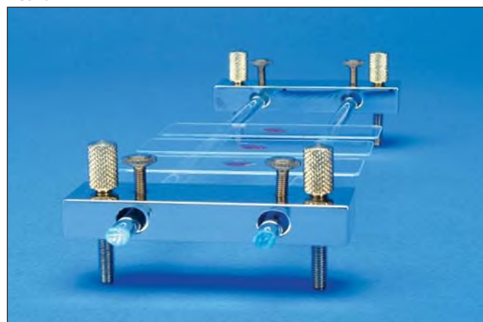
ML754 in use