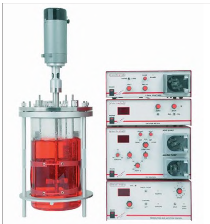
FA405 in use with FA406-08